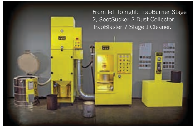
From left to right: TrapBurner Stage 2, SootSucker 2 Dust Collector, TrapBlaster 7 Stage 1 Cleaner.

Removing the ash from all the cells early and often thwarts this